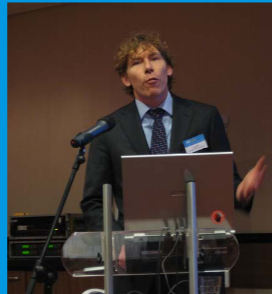
Under: Referee Klaas Pei, European Commission